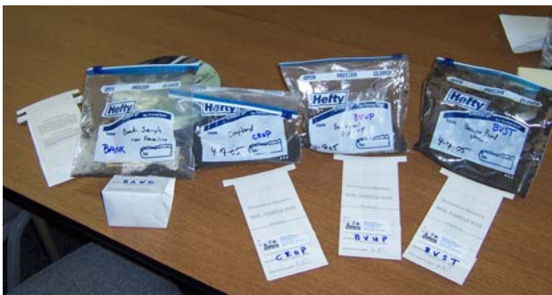
Left Photo: Soil samples from Campbell Creek