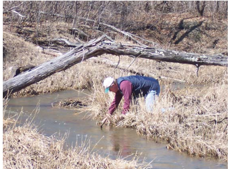
Above Photo: PRWD Manager Orrin Okeson is collecting water and soil samples along Campbell Creek.