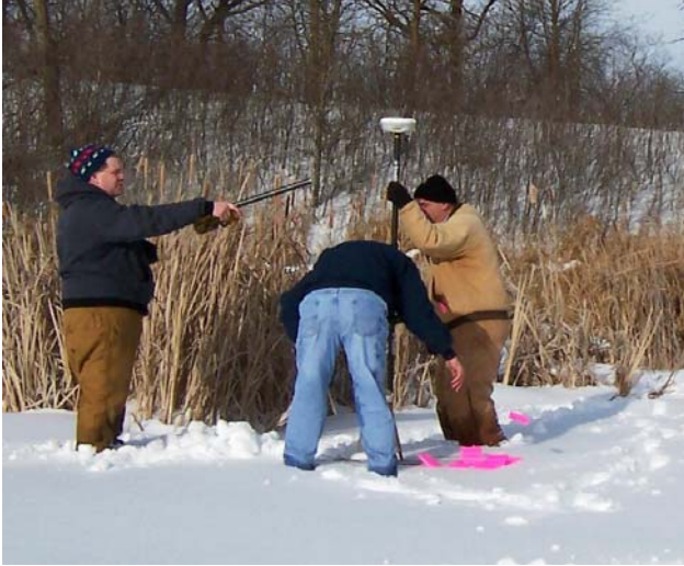
Natural Resource Conservation Service (NRCS) surveying Rice Wetland in the winter.