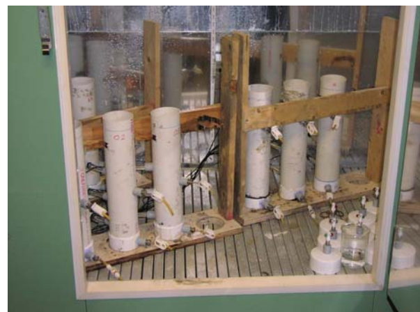
Left: Collecting soil cores from the Rice Lake Wetland